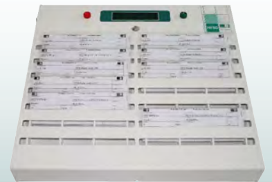
RFID Customized Solutions