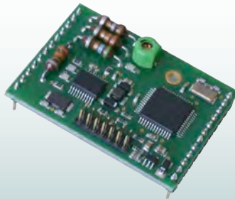
RFID Products OEM Module