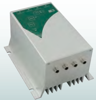
RFID Products UHF