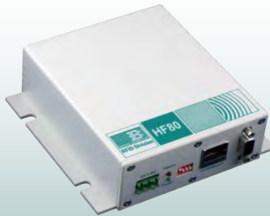
RFID Products HF