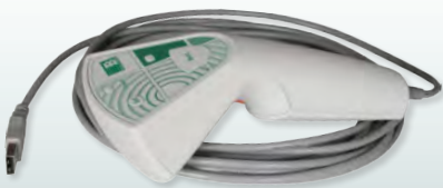
RFID Products Mobile