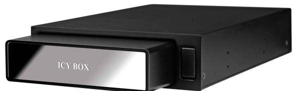
IB-390StUSD-B External Case incl. 5.25" docking station