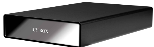
IB-390StUS-B External Case incl. stand foot